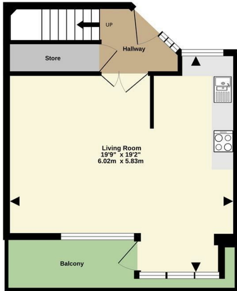
Fourth Floor 385 sq.ft. (35.8 sq.m.) approx.